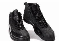
air force one AF1 low top shoes white grey black ID:5160 Free Shipping